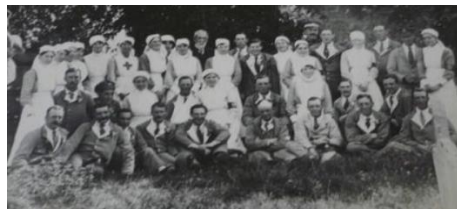
VAD Gosport 1918