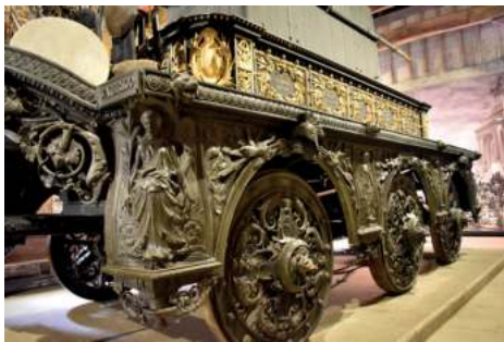
Wellington's funeral carriage