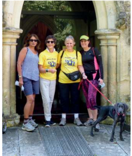
Ride & Stride 2019, the St Mark's Ampfield Team raised £560

On the Isle of Wight, at Holy Trinity, Bembridge, children with their church mice companions, rather more cuddly than the real thing, went far and wide on the Island to discover what other churches had to offer and to raise money. They found the oldest church on the Island, St Boniface at Bonchurch (11th century) and their namesake church, Holy Trinity in Cowes. Amongst other visits they met a former choir boy of long ago who was at Holy Trinity, Bembridge but now at St Agnes, Freshwater. One particularly adventurous and remarkably mobile mouse managed to get to Capalbio, Tuscany, Italy.