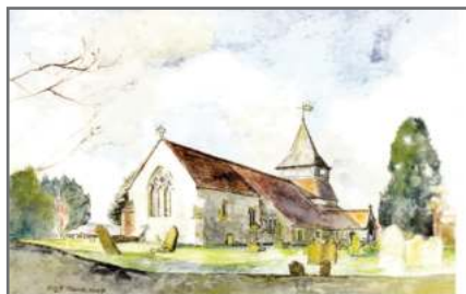
St Peter and St Paul, King's Somborne

For p&p costs or to arrange collection, contact: joanappleyard@aol.co.uk or 01794 388224