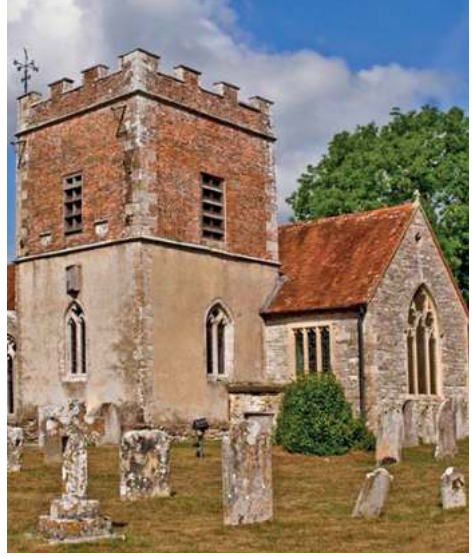
St John the Baptist, Boldre